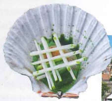
A must-try: seared scallop at Issho

We've enjoyed tucking into chef Ben Orpwood's food at hip London hang-out Sexy Fish and we can't wait to catch his delicious Japanese-inspired cuisine such as seared scallop with jalapeño and apple at the new rooftop restaurant Issho. (issho-restaurant.com)